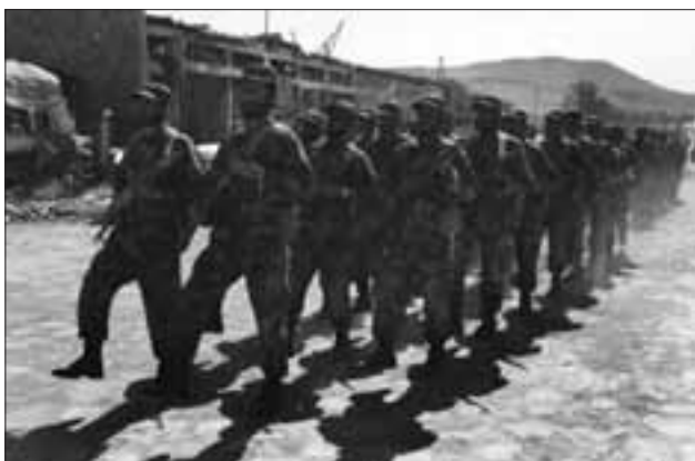
1 st Battalion, Afghan National Army

To help establish a working relationship with the militia force based on mutual trust and respect, some ground rules were initially established. First, ODA members were not allowed to use derogatory terms when referring to the Afghan Militia Forces. Using profanity or shouting at the militiamen could get you a one-way ticket back to Bagram. Most members of the militiamen did not speak English, but they did understand when you were talking about them in a derogatory manner. The rule was that you manhandled a militiaman only when it was necessary. Second, ODA members would pay the correct amount for services and goods. Not paying enough is the same as robbery and leads to ill will among the civilian population. Also, it establishes a dangerous example for your indigenous forces. The guns and troops present an intimidating image to local people, keep this in mind. No ODA member is to accept gifts. Accepting a valuable gift only sets up the expectation that you now owe the gift giver a favor. If you maintain the moral high ground when dealing with all aspects of daily