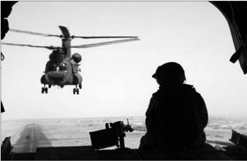
View from door gunner's position of CH-47 Chinook helicopter.

On 10 October 2001, the 5 th Special Forces Group deployed to a staging area not far from Afghanistan. There they united with other Army Special Operations Forces units to create “Task Force Dagger.” The units which worked with the