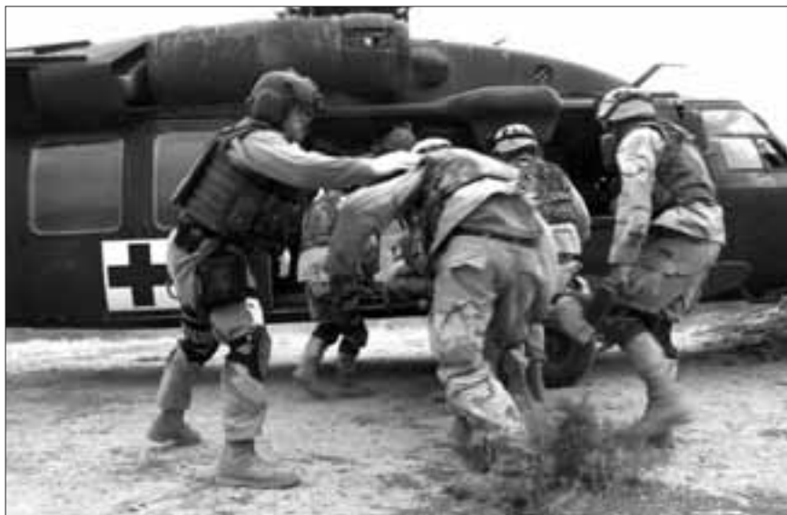
Soldiers of the 68 th Medical Company assist a patient onto a helicopter.