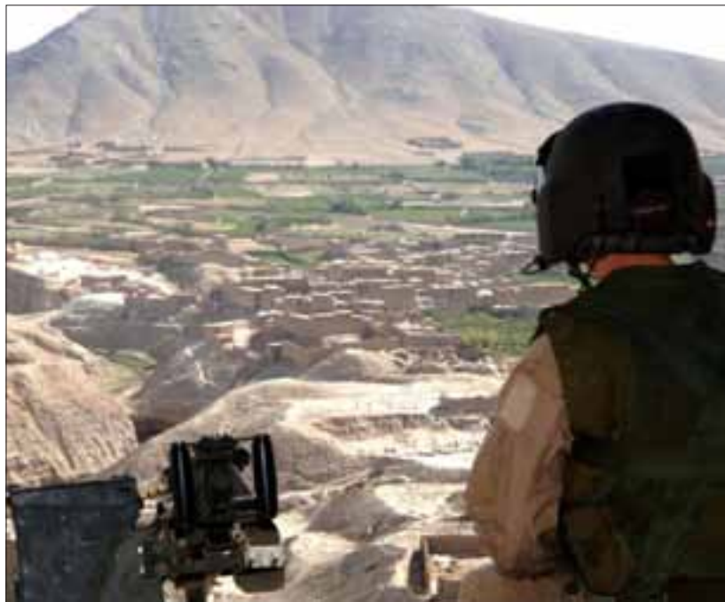
by Spc. Joshua Balog, October 5, 2005 | A Soldier from Task Force Sabre performs rear security aboard a CH-47 Chinook helicopter near Kabul, Afghanistan.