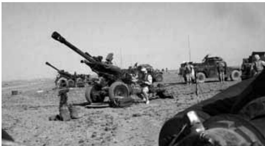
M119A1 105 Lightweight Towed Howitzers

rocket-assisted projectiles and Charge 8). Every round fired supported an essential fire support task and took the form of demonstration fires, precision registration fires, counter rocket and counter mortar fires, or danger-close support for troops in contact.