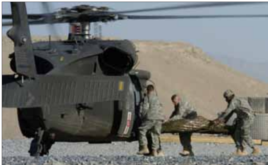
by SrA Brian Ferguson, September 1, 2006 | Soldiers load a casualty aboard a UH-60 air ambulance during a medevac mission near Qalat.